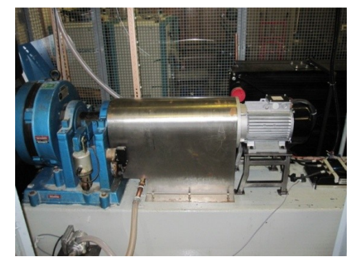
Fig. 2. Dynamometer hardware

The Dynamometer which will be used for the test system was rebuilt in 2011 to provide bespoke test facilities for EV drive train components. The system consists of a Froude Hofmann EC38TA (Eddy Current) dynamometer, shown in figure 2, which is controlled from a Texcel V4 ECE/HE controller, shown in figure 3.