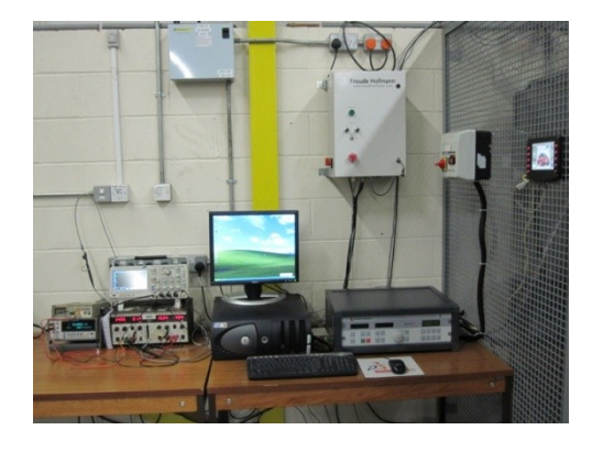
Fig.3. Dynamometer control and datalogging equipment

The dynamometer is currently fitted with an EV drive train which consists of: