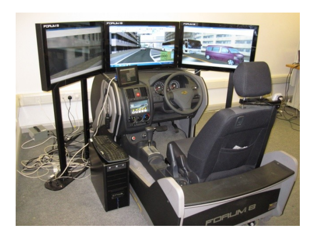
Fig.1. Forum8 driving Simulator

The hardware component of the simulator is a Forum8 Driving Simulator and is illustrated in Figure 1. The hardware is based around a vehicle cockpit comprising all the usual controls including steering transmission selector, parking wheel, Instruments accelerator and brake. include speedometer and engine speed measurement. The display consists of three 32 inch LCD screens, each with a resolution of 1024x768 pixels and a fourth, smaller 8.4 inch LCD TFT screen with a resolution of 800x600 pixels which can be used for display of navigational information or other data to the driver.